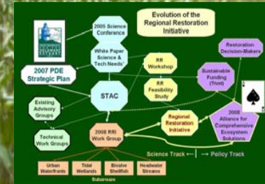
Figure 1. The Regional Restoration Initiative (RRI) was developed as a habitat strategy for meeting restoration coordination needs articulated in the CCMP and other workshops and reports. The RRI is being launched with two focus tracks, one devoted to science and the other devoted to consensus building.

To facilitate the flow of science-based recommendations to decision-makers, and restoration priorities and needs from decision-makers to scientists, a policy-oriented group was also envisioned in the blueprint report. This "consensus group" was named the Alliance for Comprehensive Ecosystem Solutions (ACES).