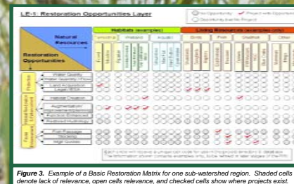
Figure 3. Example of a Basic Restoration Matrix for one sub-watershed region. Shaded cells denote lack of relevance, open cells relevance, and checked cells show where projects exist.

Rapid decision tools remain the focus so that project selection can occur at any time using best scientific judgment, but over time the new Regional Restoration Work Group will strengthen these tools.