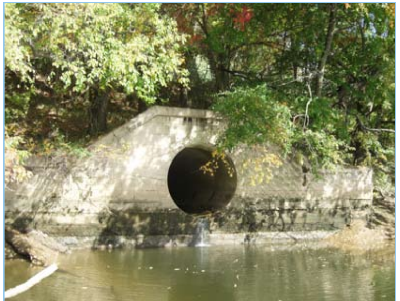
Water flows from a sewer's outfall pipe in Philadelphia, where scientists are keeping a close watch on the radioactive pollutant Iodine-131 (see page 3).