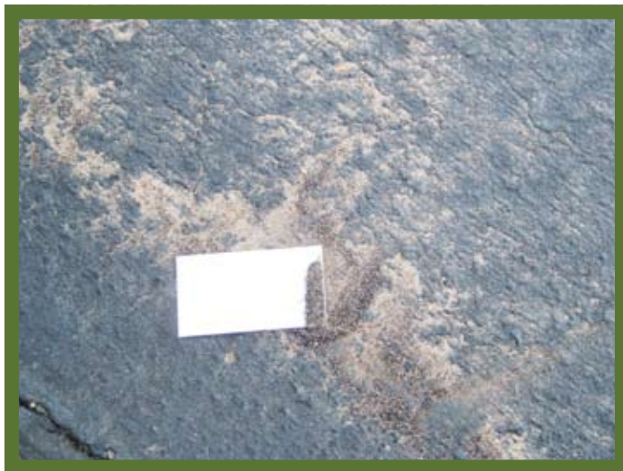
Coal tar sealant flakes off an aging application, where it will sit until wind, rain, snowmelt or tracking carries it to the nearest sewer, soil or stream.