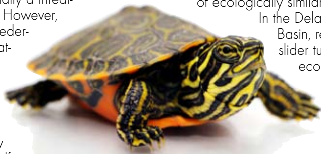
A baby red-bellied turtle ( Pseudemys rubriventris )