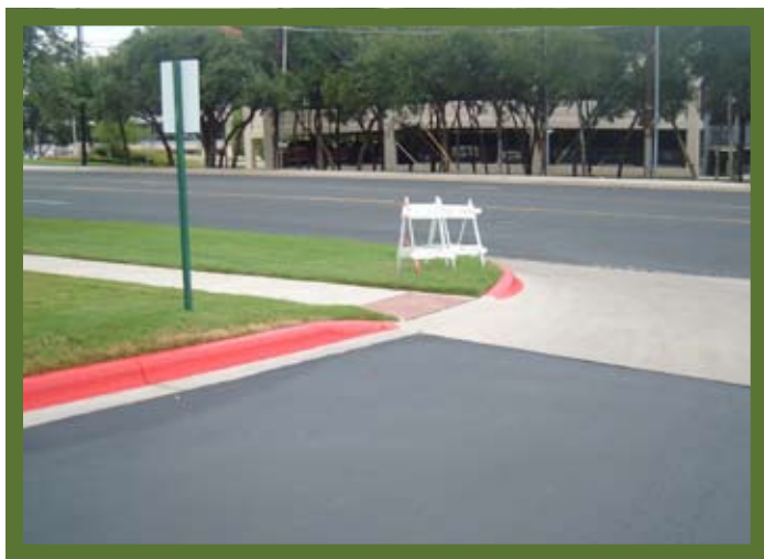
The entrance to a parking lot appears as black as nearby asphalt after being coated with coal tar sealant, a substance now banned by a growing number of municipalities and corporations.

PAHs are created from the incomplete combustion of organic material and can come from a variety of sources, but in much smaller concentrations. According to a 2005 study by the City of Austin, the concentration of coal tar sealant is dramatically higher than that which flakes off any other source. In fact, the flakes that come off a driveway are more than 1,000 times more toxic than the "effects concentration" of aquatic species. The effects concentration is the