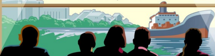
Illustration and Design ©2011 Frank McShane.

The Partnership for the Delaware Estuary leads collaborative and creative efforts to protect and enhance the Delaware Estuary and its tributaries for current and future generations.