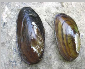
Shellfish and Other Signature Species