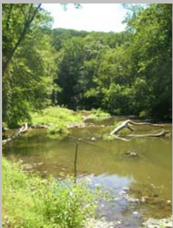
Forested Headwaters / Riparian Corridors